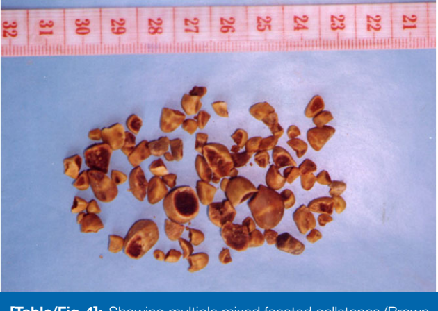
[Table/Fig-4]: Showing multiple mixed faceted gallstones (Brown-ish)

and other bile pigments [Table/Fig-4,5].